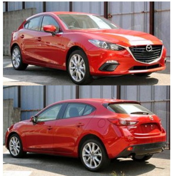
Mazda 3 hatch

The bumper scored maximum points for the protection provided to pedestrians' legs. However, the protection provided by the front edge of the bonnet was predominantly poor. The bonnet surface showed good or adequate protection over most of its surface, with poor results recorded on the stiff windscreen pillars.