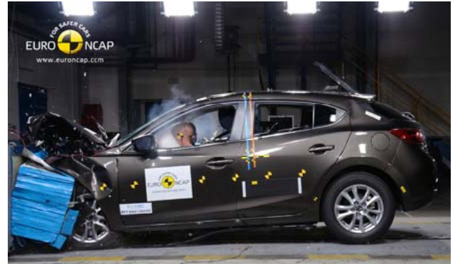
Frontal offset test at 64 km/h (Euro NCAP)

Note: The left-hand-drive European hatch was tested by Euro NCAP. ANCAP was provided with information which showed that the Euro NCAP results apply to all Australasian variants.