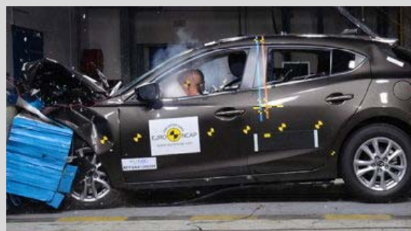
Frontal offset test at 64km/h