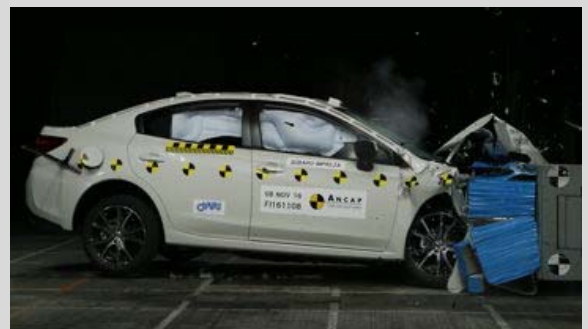
Frontal offset test at 64km/h (Subaru Impreza)