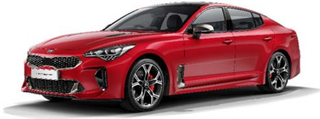
Kia Stinger GT