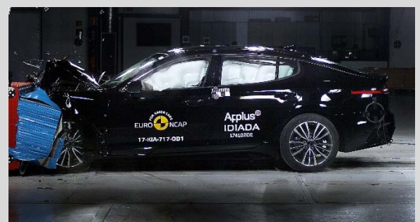
Frontal offset test at 64km/h