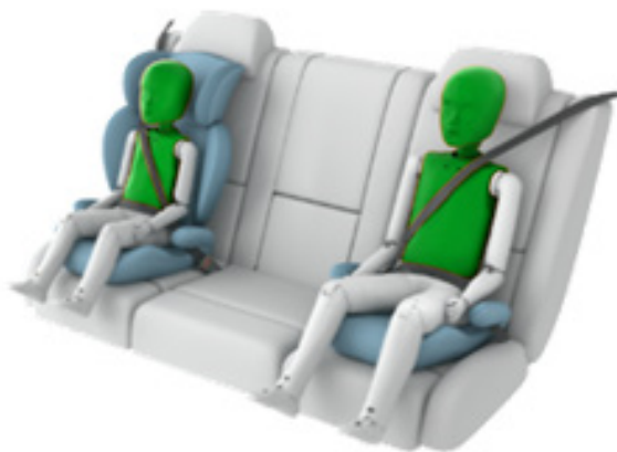
6 year old