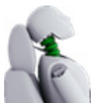
Driver / Front Passenger