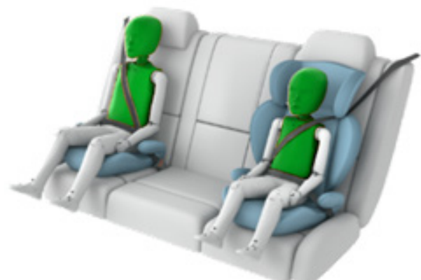
10 year old