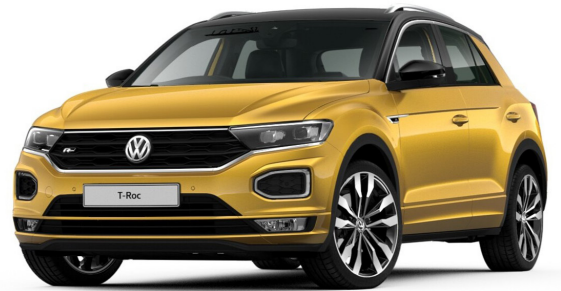
VOLKSWAGEN T-ROC (NZ)