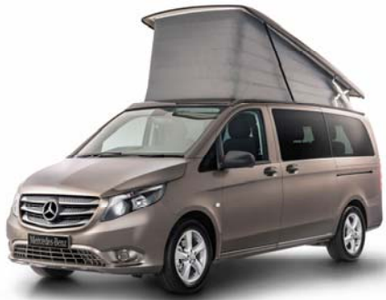
Mercedes-Benz Marco Polo Activity