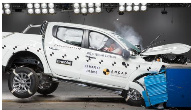
Frontal offset test at 64km/h