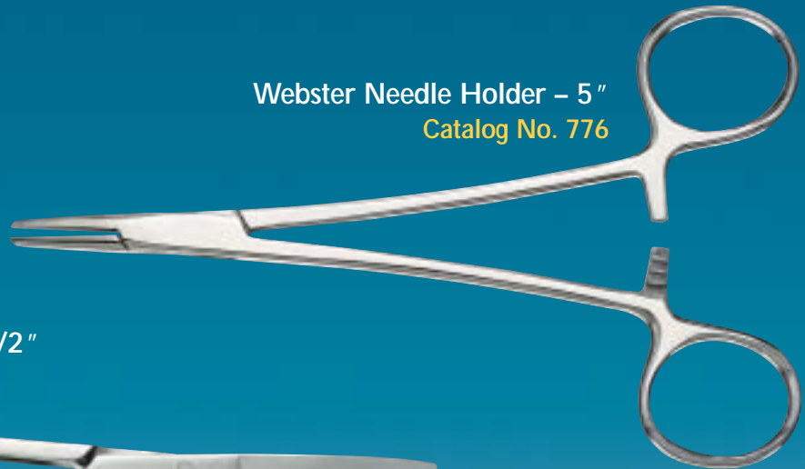
Webster Needle Holder – 5" Catalog No. 776