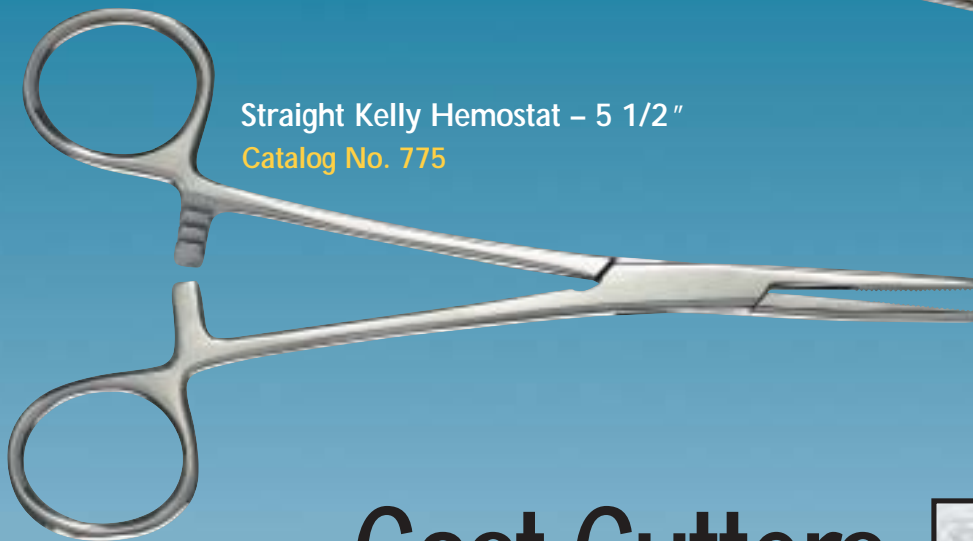
Straight Kelly Hemostat – 5 1/2" Catalog No. 775