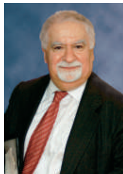
Giving their all A service summit co-presented by TIME will include, clockwise from top left, New York City mayor Bloomberg; co-chair Powell; California governor Schwarzenegger and co-chairs Gregorian and Kennedy

summit a place for not only dialogue but also action. To that end, ServiceNation is working with Senators Ted Kennedy and Orrin Hatch on legislation designed to expand opportunities for volunteering and national service. ServiceNation will urge the next President and Congress to enact that legislation by Sept. 11, 2009. Two weeks after the summit, ServiceNation will engage tens of thousands of Americans in hundreds of events across the country in a national Day of Action to highlight the benefits and goals of citizen service.