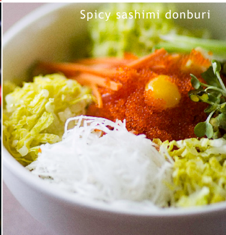
Spicy sashimi donburi