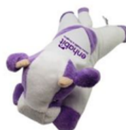
PURPLE COW Minimum: 5