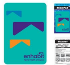
MICROPAD Minimum: 10