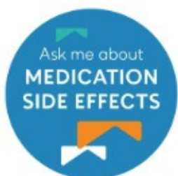
BUTTON: MEDICATION SIDE EFFECTS Minimum: 25