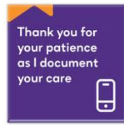
BUTTON: MOBILE DEVICE Minimum: 25