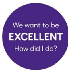
BUTTON: PATIENT SATISFACTION Minimum: 25