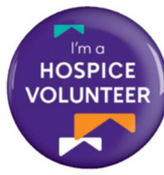
BUTTON: HOSPICE VOLUNTEER Minimum: 25