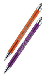
STYLUS CHROME PENS Minimum: 1 Pack (30 pens pack)