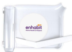
PILL COUNTING TRAY Minimum: 5