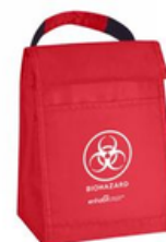
BIOHAZARD BAG Minimum: 5