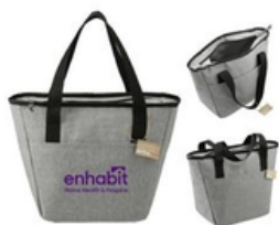
NEW HIRE WELCOME TOTE/COOLER Minimum: 5