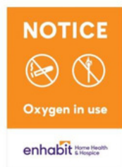
OXYGEN STICKER Minimum: 25