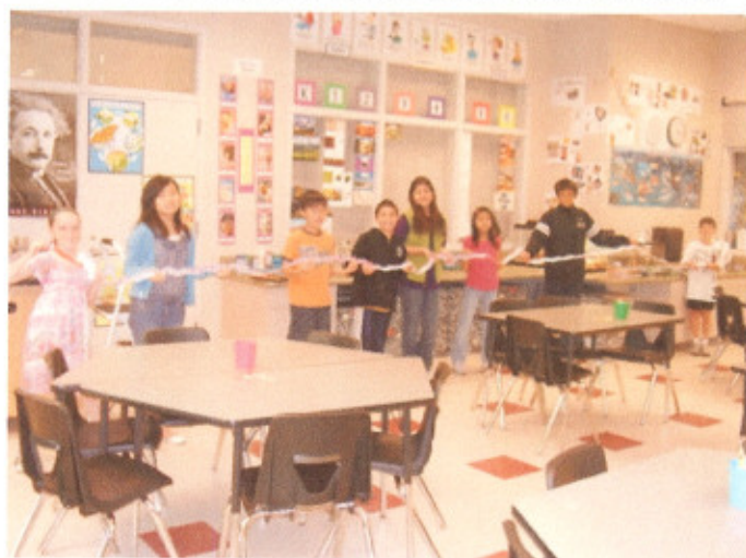
5 th graders holding our life size model of the digestive system