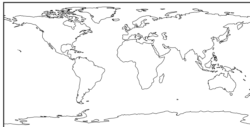
gchp-c24-1Mon-14.2.1 (Dev) c24