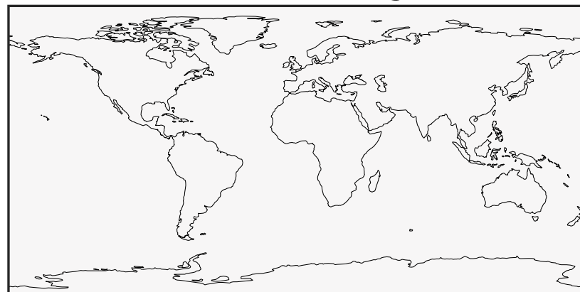
Difference (1x1.25) Dev - Ref, Restricted Range [5%,95%]