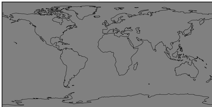
Ratio (1x1.25) Dev/Ref, Dynamic Range