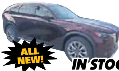
2024 MAZDA C90 HYBRID IN STOCK!