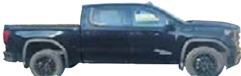
20" WHEELS, TURBO!