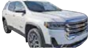
6 PASSENGER SEATING