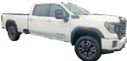
FULL SIZE 8' BED!