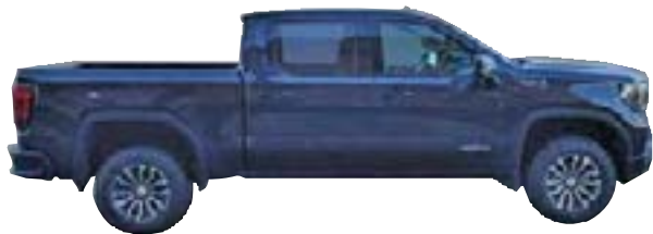
2023 GMC SIERRA 1/2 TON CREW CAB AT4 4X4 DURAMAX DIESEL!