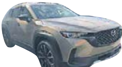
2023 MAZDA CX5 AWD 8 CX5'S AVAILABLE!