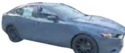
2023 MAZDA 3 SEDAN "CARBON EDITION"