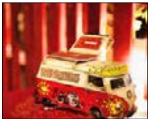
File A variety of items can be appraised including but not limited to automotive items, fine art, furniture and toys.

According to Kamban, the following items will not be appraised during this event: weapons including guns, swords and knives and