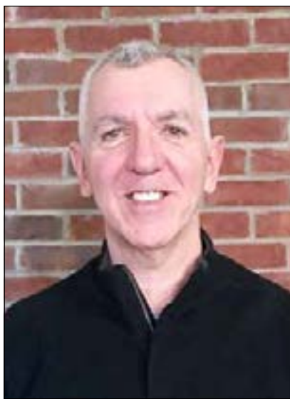
Mayor Greg DiDonato

Payments from the Claymont High School tax began when the school opened in 2001 and were paid regularly until the end of 2020. Payments