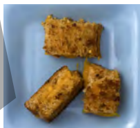
Small pieces of grilled cheese sandwich