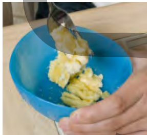
Mashed soft fruits, like bananas