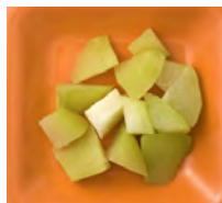
Small pieces of soft peeled fruits, like melon

In addition to everything your baby is already eating, he may be ready for small pieces of your family’s foods. Start with soft foods at first, and then move on to firmer textures when he’s ready. Some foods he may like: