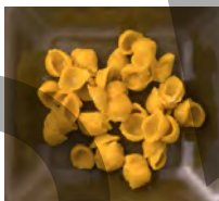
Small bites of pasta or noodle dishes