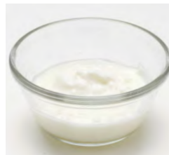
Plain yogurt mixed with fruit