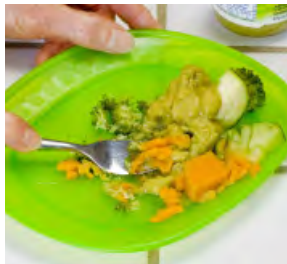
Mashed soft-cooked vegetables, like sweet potatoes

By about 7 or 8 months, your baby may be ready to try mashed foods in addition to what he is already eating. Use the back of a fork to mash foods well. Here are some foods he may like to try: