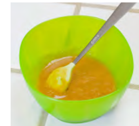
Pureed vegetables, like carrots

At around 6 months, your baby may be ready to eat smooth food that has been strained or pureed. Here are some examples: