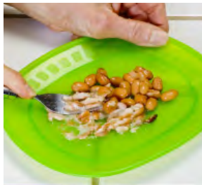
Mashed soft-cooked beans