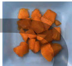
Chopped soft peeled fruits, like ripe papaya