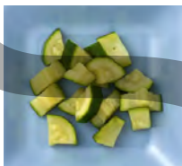
Small pieces of soft-cooked vegetables, like zucchini