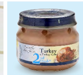
Well-pureed meat, like turkey