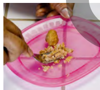
Small pieces of cooked meat, like ground beef