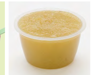
Pureed fruits, like unsweetened applesauce