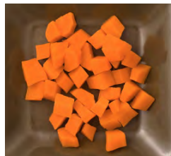
Chopped soft-cooked vegetables, like carrots

Your baby is already eating pureed and mashed foods. She may also be ready for chopped soft foods. Just be sure to cut up everything into small pieces. Here are examples of foods she may like to try: