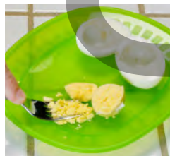
Chopped cooked egg yolk (no egg whites)