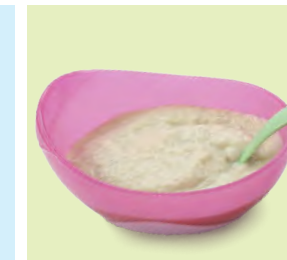
Rice, oat, or barley cereal