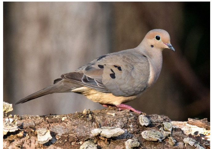
Figure 2. Climate at the Park in summer is projected to remain suitable for the Mourning Dove ( Zenaida macroura ) through 2050.

may serve as an important refuge for 8 of these climate-sensitive species, 5 might be extirpated from the Park in at least one season by 2050.