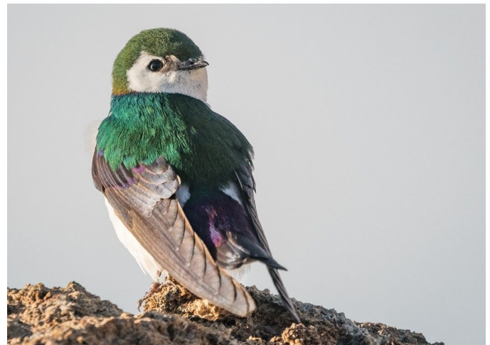
Figure 2. Climate at the Park in summer is projected to remain suitable for the Violet-green Swallow ( Tachycineta thalassina ) through 2050.

may serve as an important refuge for 10 of these climate-sensitive species, 4 might be extirpated from the Park in at least one season by 2050.