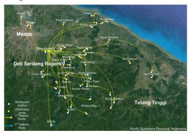
Figure 1. Distribution route map of initial distribution center.

In the calculation of distribution cost for initial d<sub>29</sub> ibution center location obtained a result of Rp 7.135.828. This result is the optimal result that can be applied to the initial distribution center. Then, in the calculation of distribution cost for the proposed distribution center location obtained Rp 6.965.143 as the optimal result. This cost is smaller than the previous cost. If calculated, the proposed distribution center will reduce cost by 2,39% per day. Beside cost aspect, the total distance that must be taken by pickup vehicle at the proposed location is also shorter than the initial location. The difference in the distribution route between the initial distribution center and proposed distribution center on the map can be seen in figure 1 and figure 2.