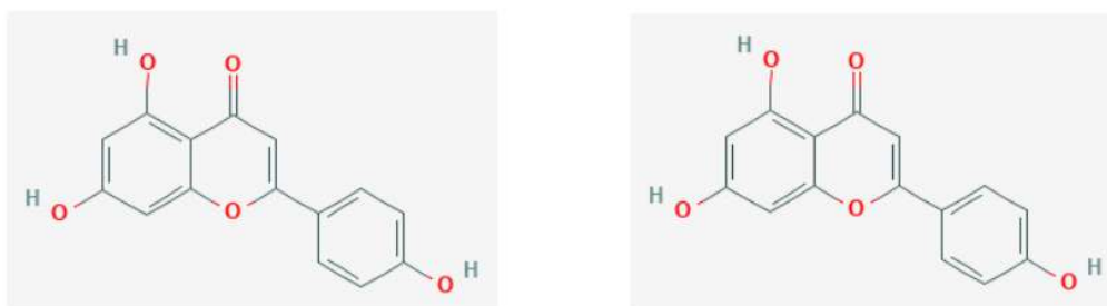
Figure 3: Structure of Apigenin (Left) and Scutellarein (Right)

Apigen and scutellarein are part of flavonoid family which are found mainly in basil leaves ( Ocimum basilicum L.) [10, 3]. Apigenin is a trihydroxyflavone which is flavone substituted by hydroxyl groups at 4', 5, and 7 while scutellarein is also a flavone which derives from an apigenin substituted with hydroxyl groups at C-4', 5, -6, and -7 [11, 12]. Flavone is one type of flavonoid compound which has various pharmacology properties. One of its pharmacology properties is radical scavenging which can prevent injury cause by free radical in various way and one is the direct scavenging of free radical. Due to hydroxyl group in flavonoid compound, the free radical are made in active [13]. Because of more number hydroxyl group in the scutellarein than apigenin, antioxidant activity of scutellarein become more potent than apigenin. The structures of apigenin and scutellarein are shown in the following figure 3.