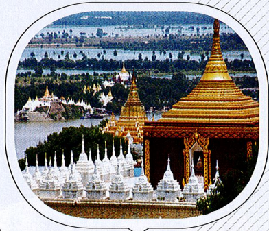
The Orcaella will sail Burma's famous Irrawaddy River, docking in remote villages.

● Travelers searching for a luxurious route into Burma should book passage on the Orcaella (from $5,040 a person for seven nights; 800-237-1236; orient-express.com ), a state-of-the-art river cruiser from Orient-Express that makes its maiden voyage in July. The 25 cabins on this intimate vessel, named after dolphins that inhabit the country's Irrawaddy River, all feature balconies and floor-to-ceiling sliding glass doors. The boat allows passengers to experience rarely visited villages and countryside, offering a unique window on Asia's destination du jour.