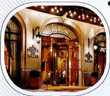
Paris's Prince de Galles hotel is steps from the Champs-Élysées.

● Paris has a brand-new pair of "baby grand" hotels, both reimagined by famed architect Pierre-Yves Rochon. At the Prince de Galles (rooms, from $1,000; 33 Av. George V; 33-1/53-23-77-77; princdegallesparis.com ), reopening in May on Avenue George V, the Art Deco-style building now features contemporary touches like sleek marble floors and dark ebony wood in its apartment-style rooms and suites. The Grand Hôtel du Palais Royal (rooms, from $840; 4 Rue de Valois; 33-1/42-96-15-35; grandhoteldu-palaisroyal.com ) underwent a year-plus renovation in its transformation from a three-star to a five-star hotel. The 68 refreshed rooms offer views of the Louvre, the Palais Royal courtyard and the Tuileries. ♦