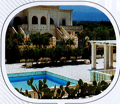
A view of the Puglian countryside from one of Borgo Egnazia's pools

● Puglia, Italy, with its rugged beauty and undeveloped coastline, is poised to be the next Tuscany. Borgo Egnazia (rooms, from $285; Savelletri di Fasano, Brindisi ; 39-080/225-5000; borgoegnazia.com ) sets the regional standard for luxury accommodations with its ocean-view villas, which come with multiple balconies, roof terraces, lush gardens and private pools. And now its owners have opened San Domenico a Mare , a four-room villa (from $2,590; Savelletri di Fasano, Brindisi ; 39-080/482-7769; masseriasandomenico.com ) on the Adriatic, which can be rented in its entirety or by individual room. Golf at the nearby course should be followed by sunset drinks in the sand.