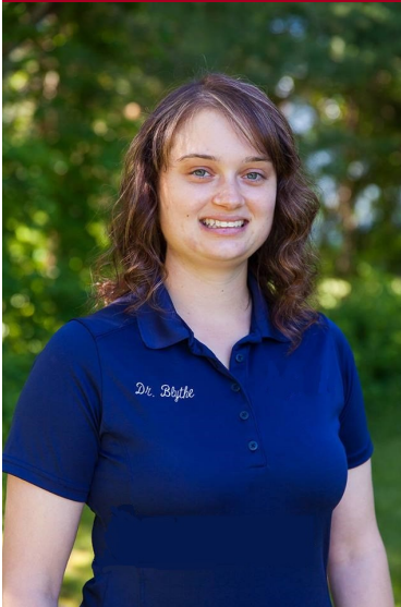
The Animal Hospital of Cornelius announces the addition of our newest DVM .