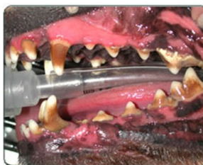
Dog's Teeth Before Dental Cleaning

Throughout the procedure, our Licensed staff closely monitors each pet and addresses their needs. From start to finish, a routine dental cleaning takes only about 20 minutes, and pets are ready to go home shortly after. See immediate results!