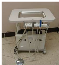
We use the same instruments as your Dentist!

Don't be scared away by infomercials that make dental procedures sound expensive and risky to your pet's health. Sedation dentistry is a rising trend amongst human practitioners, and we're beginning to think they got the idea from the veterinary world. Not too often is "Fluffy" going to willingly let us see or touch her teeth, unless she intends to break skin! Let's walk through the procedure from start to finish. We will use "Fluffy" as an example.