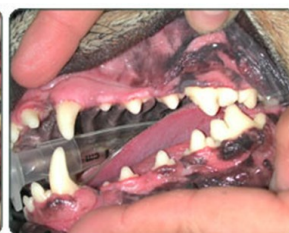
Dog's Teeth After Dental Cleaning

You can prevent dental disease at home with Dental Chews, Oral Rinses, and even brushing your pet's teeth!