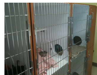
Cat condos have access to multiple "rooms" and hiding spots, as well as a view of the waiting room.

Along with our new kennel service, we also offer day boarding, behavior training, and full service grooming services. Summer Special- For June and July, board your cat for only $7/night and your dog for only $11/night!