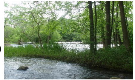
Matthaei Botanical Gardens & Nichols Arboretum

There are plenty of restaurants that allow pets on the patio while you enjoy the warm Michigan spring along Main Street and Sidetracks in Depot Town. After lunch, you can take your pet to any number of locally owned pet shops including The Pet Emporium and Wags to Whiskers, where they make pet specific treats fresh! Or how