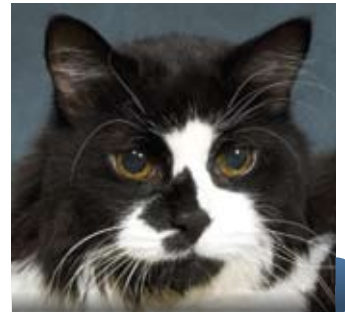
Healthy senior cats should see the veterinarian every 6 months.

Just as with people, it’s important for feline patients to see their doctors more frequently as they age. During a senior wellness exam, your veterinarian will screen your pet for a variety of age-related health concerns. A thorough senior wellness exam is designed to: