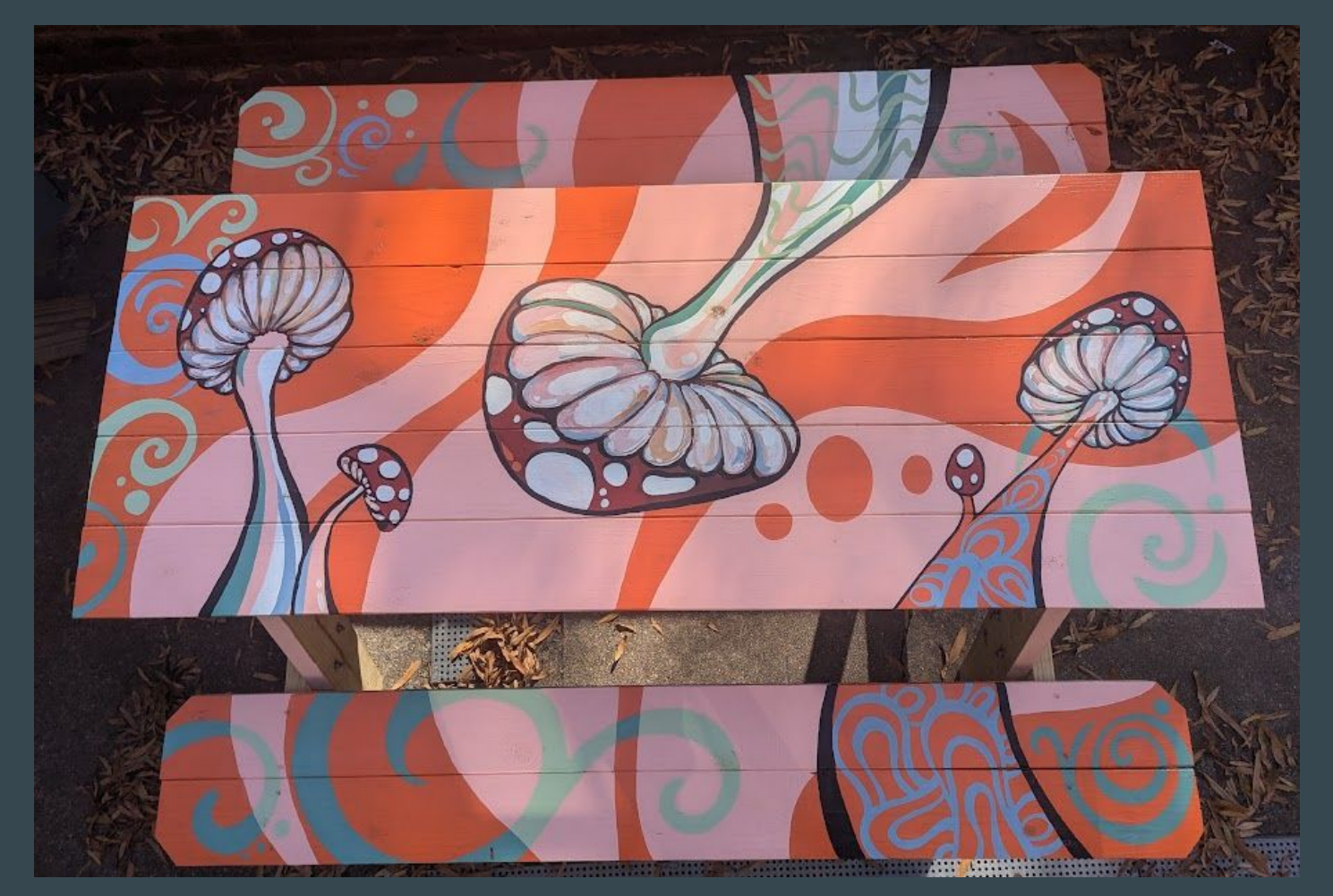
"Whimsy," Picnic Table commissioned by the NoDa Neighborhood and Business organization, Charlotte, NC. November 2024. 8'