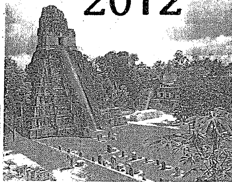
The Great Plaza at Tikal