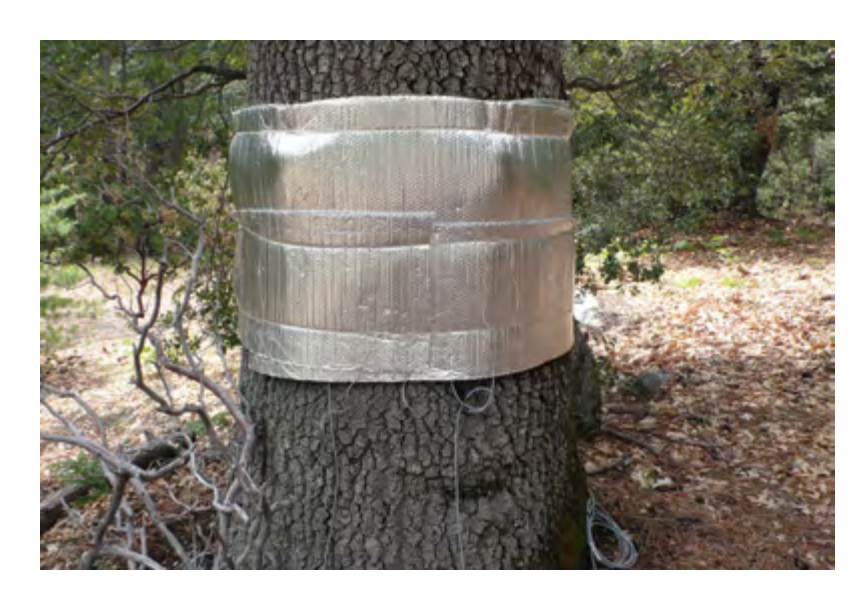
Tree sap flow sensor as part of the CENS testbed, the University of California James Reserve.

making activity unfold. Environments are the possibilities for subjects to make sense in the first place. This is why his term subject/superject is critical. Superject is a processual environmental way of understanding, a kind of extended milieu (to use Simendon's term) in which an array of entities and relations takes place. which I wouldn't describe as a mesh or a network. I find environment an interesting term because of its troubled and interesting history and because it points to concerns about environments. You could use the term milieu but. in a way, environment grapples with the worlds that we're bringing into being, the kind of processes that we're engaged in, and the ways in which we're becoming along with our environments. There is also a kind of material register to those processes that cannot be waved away with forms of abstraction in an attempt to theorise the 'soup' that we're stewing in.