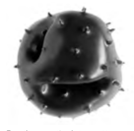
Dustbox particulate matter (PM<sub>2,5</sub>) air quality sensor. The interior electronics consist of an optical PM<sub>2,5</sub> sensor, Wi-Fi connectivity, micro-controller, and miniature fan for constant airflow.

Simondon comes in. Simondon doesn't accept the settlement of the human; he throws that category open. He tries to understand how, through various processes, both relationships and subjects settle into particular entities, environments, and relations. If you apply this thinking to the idea of the citizen, then you can understand that who or what is a 'citizen' is always an open question. The openness to the environment in the thinking of Whitehead and Simondon also means that a cognising subject is not the apex of sense-making activities. In fact, it's the opposite. In Whitehead's case, it's the environment arriving at subjective satisfaction, where subjects are expressions of environmental experience. That is the way he understands processes unfolding in the world. To say that cognising actors are not necessary for decoding sensing activities is a real opening into practice. Instead, environments include vast arrays of sensing subjects - human and nonhuman - working with and alongside modes of theory that we might articulate as we make sense of the world. Sense is then rather something that arrives through collective and environmental experiences.