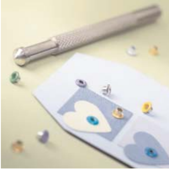
Eyelets are fun new embellishments for paper craft projects