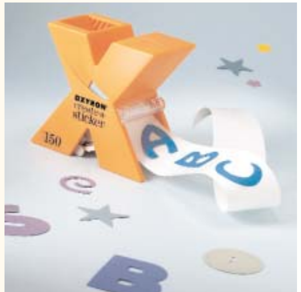
Mini Xyron makes adhering small shapes and die-cuts a snap