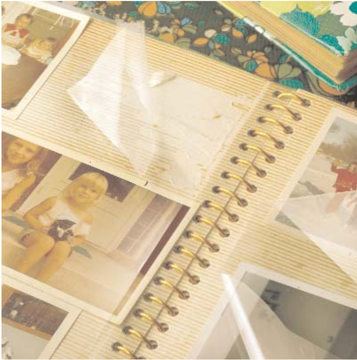
Over time, magnetic albums may be destroying your photographs

Oh, those magnetic photo albums! They seem the perfect photo solution. Their pullback plastic sheets obviously protect pictures. Their adhesive strips allow optimal display flexibility. Their cardboard pages and covers are sturdy and durable. Yet when it comes to photo safety, these magical, magnetic albums are actually a recipe for disaster.