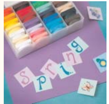
Pre-cut cardstock shapes are great for easy borders and titles

Great for titles, borders, punches, and matting stickers, these kits instantly dress up scrapbook pages and are a true timesaver! 1 1/2" squares and circles come in a rainbow of acid-free cardstock colors. The extreme combo pack contains 1,620 pieces in 27 different colors.