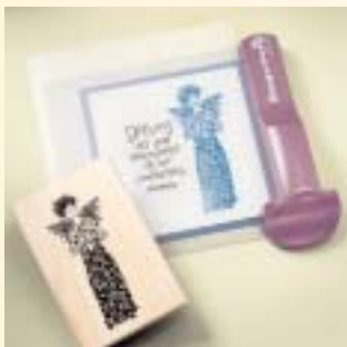
Don't worry about ever stamping in the wrong place again

Introducing a whole new dimension in stickers Jolee's Boutique™ features intricate, hand-made stickers decorated with beads, fabric, foil, wire and more. Their small size and attention to detail will add an element of "wow" to frames, paper crafts, and scrapbook pages.