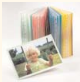
Mat stacks are quick, easy borders for your photos

Over 7,500 creative page layout ideas that have been featured in Creating Keepsakes Magazine are available at the click of a mouse. For extra ease, you can type in a key-word (ie: Halloween) and preview all related layouts. This CD is the ultimate inspirational tool.