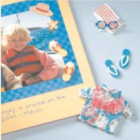
Add new dimension to projects with detailed, three dimensional stickers