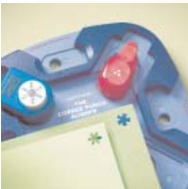
Make sure your corner punch hits the mark every time

Accurately punch your paper's corners — quickly and easily — with the Cornercopia. Simply position your punch, slide your paper into place and punch! Built-in guides help you position your paper accurately for a perfect corner punch. The Cornercopia accommodates over 45 different types of punches.