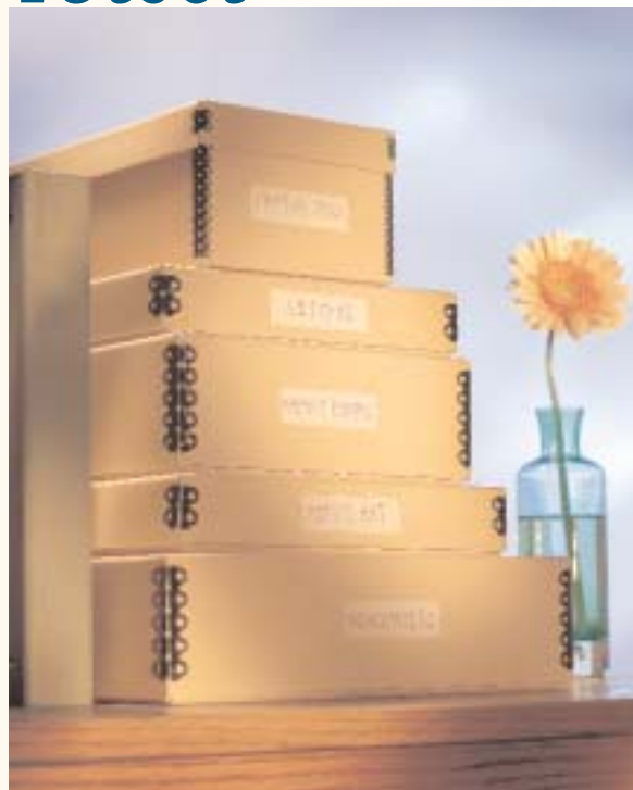
Organizing and documenting your photos and memorabilia with archival products will ensure that they will last for you and future generations to enjoy.

Silent thieves lurk in our homes. Year after year, they carry away cherished photos, irreplaceable childhood art and one-of-a-kind souvenirs. The thieves are chemicals, the environment and disorganization—and left alone, they will steal your family's legacy. Stopping these thieves, isn't an overwhelming task. A little thought and proper preservation methods will ensure that your family's faces and stories endure for generations.