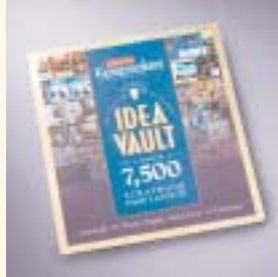
Have every Creating Keepsakes layout at your finger tips

imaging sheet and use Stamp-a-ma-jig as your guide as you stamp your image directly onto your project. This non-slip placement tool is also great for repeating patterns and designing borders! If you enjoy rubber stamping you need this tool. It is a true innovation.