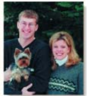
When photographing one or two people, shoot the picture vertically.