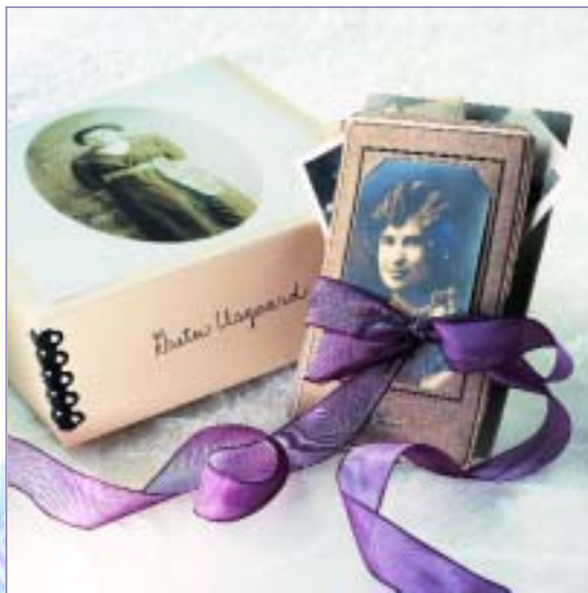
Personalized Preservation Box

If you are the family archivist, create copies of your favorite photos to share with family members. An archival storage box, topped with a photo, becomes a treasured keepsake box with photos tucked inside. This project is so easy, you'll want to personalize a box for every member of your family. Best of all, you can create this gift with one stop – from copying your photos on our archival color copier, to personalizing your archival storage box and, then, assembling your gift in our spacious workroom.