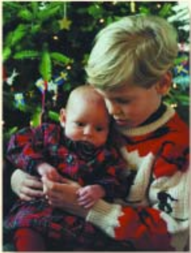
When photographing people, the golden rule is to move closer.