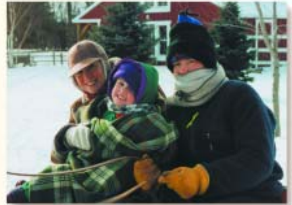
In winter, the sun sits low on the horizon and casts a pale light which impacts photo quality.

You know the holiday drill—gather the family, grab the camera and make some memories. Yet for many of us, our final photographs don't do either the people or the occasion justice.