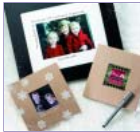
Picture Frames with Personality

Take gift giving to the next level by personalizing a picture frame. Adding a hand-made touch to one of our unique frames can be easy. Write a short message, record details of the photograph or illustrate a favorite quote on a photo mat. Not only are you sharing a photograph, you are telling a story.