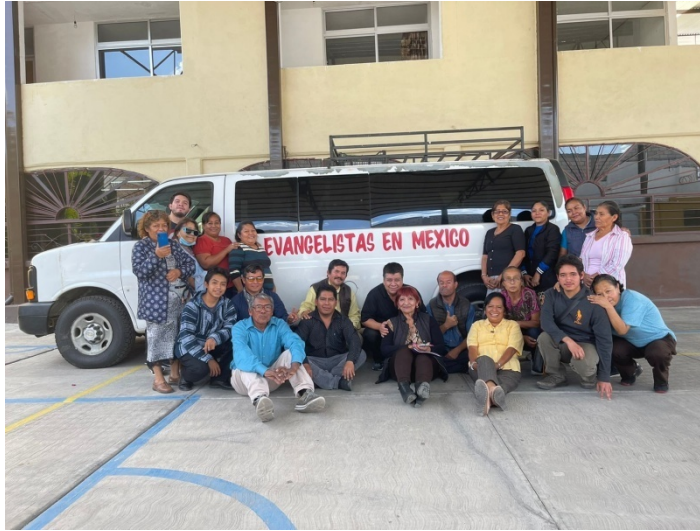
EVANGELISM GROUP FROM TIHUATLAN, VER.

2.- The plan is that the Group that is based in Tihuatlan and Tuxpan, Ver., comes and do evangelism during 2 days in “Vamos Tamaulipas” congregation and 2 days in “Nuevo Amanecer” congregation.