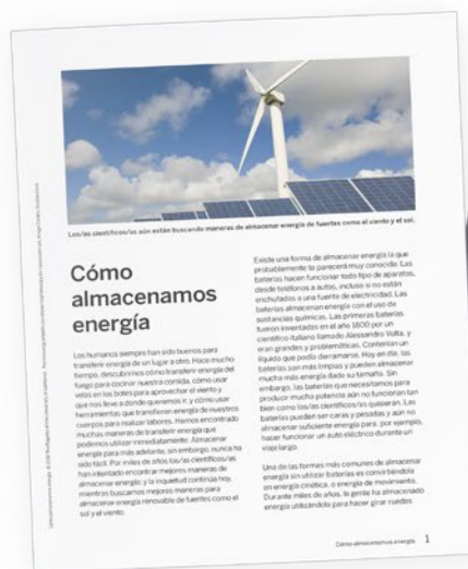
Science Article from the Harnessing Human Energy Unit