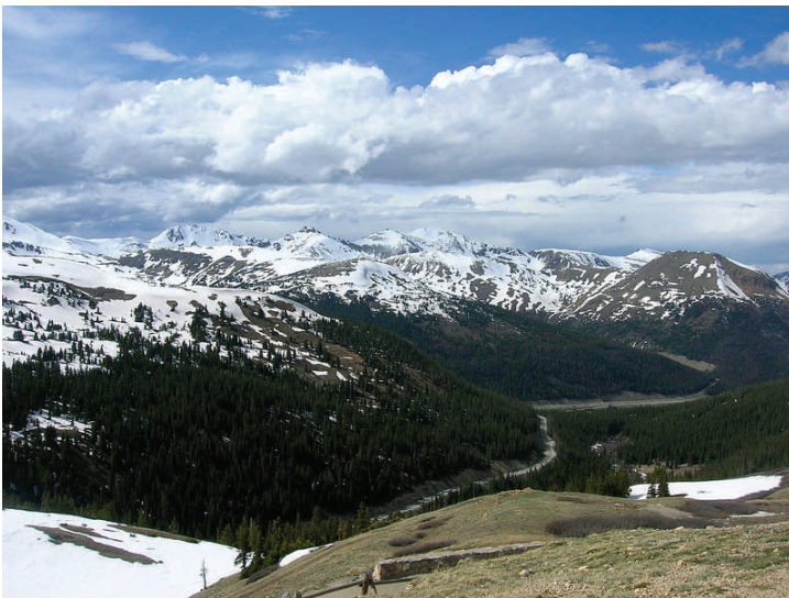
Big mountain, little bike.

A little more on I70 then a good ride over Berthoud Pass via Hwy 40. All right, I'm further than Alan and I got back in 2003; Rocky Mtn Park is not far now. The campground on the western side on Rocky Mtn Park is closed (bark beetle eradication) so I ride over the Trail Ridge Road to the next place to camp. It is a fantastic ride, especially with the current weather conditions and the dusk lighting. I took almost two hours to make the trek as I stop so much. The pictures don't adequately show the 38 degrees and wind (+12,000'). No problem, I just don't take the helmet or gloves off when I stop and wander. Most of the people that stop in their cars simply roll down their windows, snap a picture, and leave. The ecosystem is subalpine arctic tundra, quite interesting.