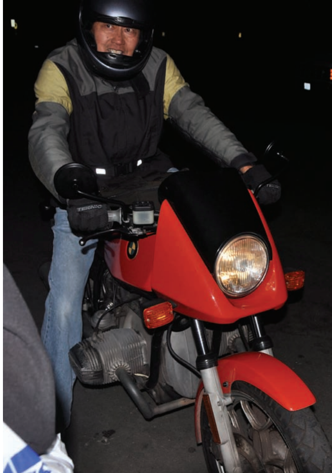
"Will bike for Hamachi"