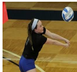
Dig Pink Game