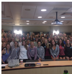
National Hazing Prevention Week