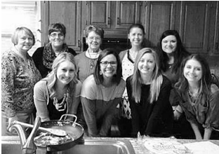
Do Good SIG serving dinner at the Ronald McDonald House. 2-26-2015