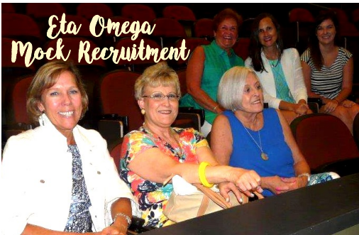
Eta Omega Mock Recruitment