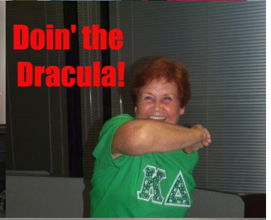
Doin' the Dracula!