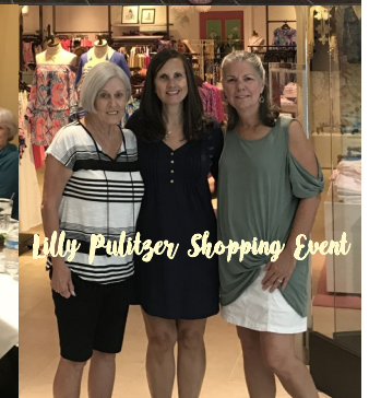
Nilly Pulitzer Shopping Event