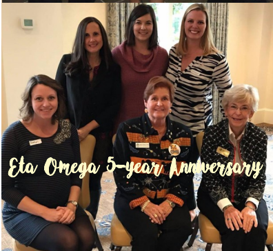
Eta Omega 5-year Anniversary