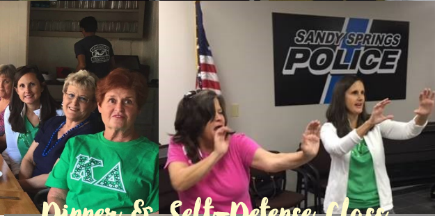
Dinner & Self-Defense Class