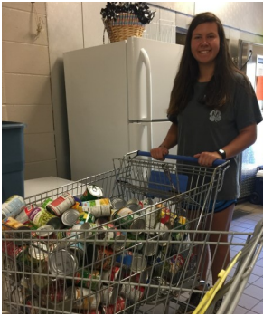
An Epsilon Gamma sister helps transport the 435 cans of food collected for Backpack Buddies of Lumpkin at Foam for the Home.