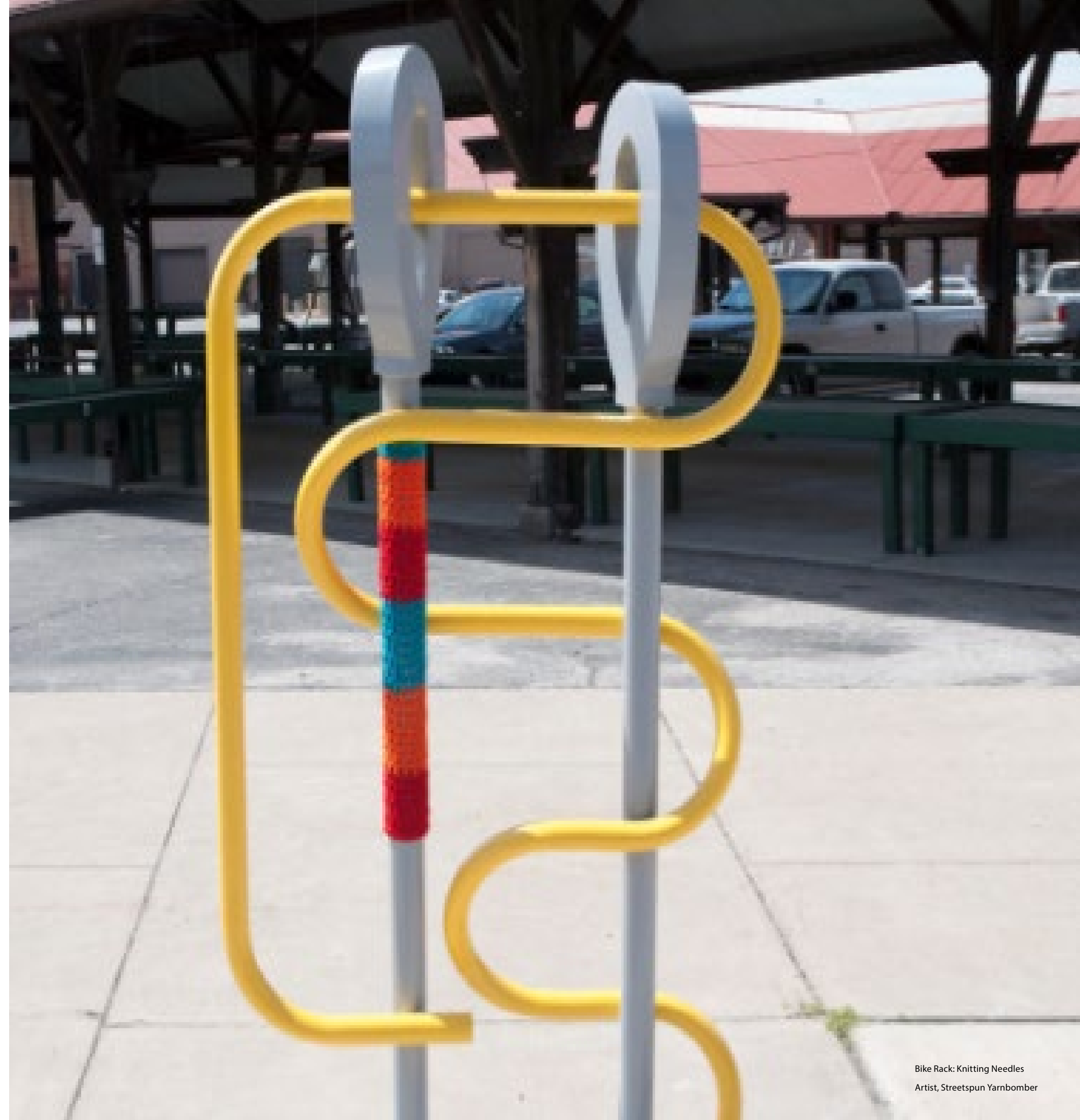
Bike Rack: Knitting Needles Artist, Streetspun Yarnbomber