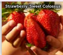
Strawberry 'Sweet Colossus'