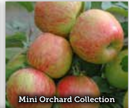
Mini Orchard Collection