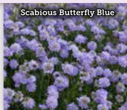
Scabious Butterfly Blue