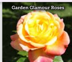
Garden Glamour Roses