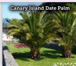
Canary Island Date Palm