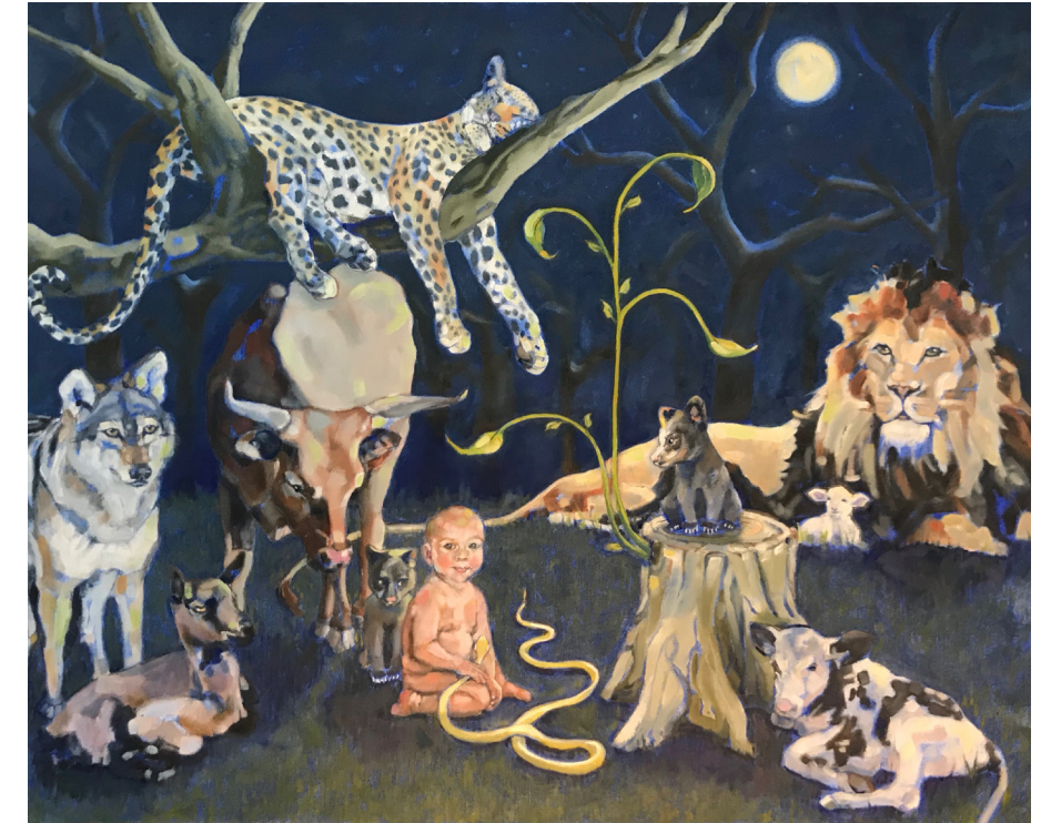
Artwork: Painted by Sue Naum