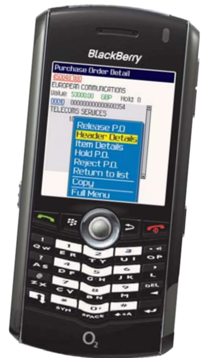
BlackBerry® 8100 smartphone

In conjunction with its mobile service provider O2 and iQlink, Warburtons implemented the SkyMobile SAP PO approval application in less than one month.