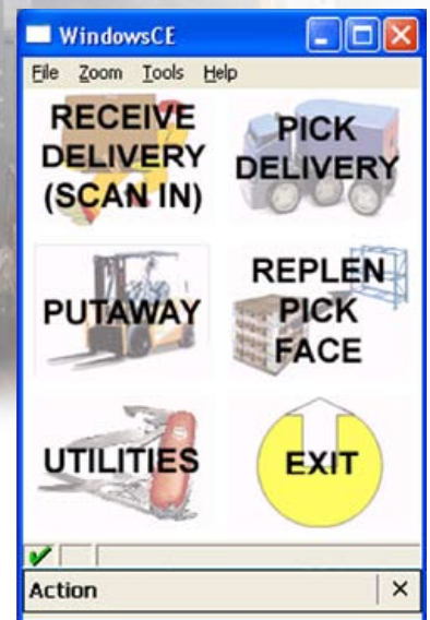
Typical User Interface

As well as some standard inventory movement / warehouse management transactions, Princes also wanted to use the SAP Stock Transport Order process to control the supply of raw materials to the plant. This process had already been successfully deployed in their pilot project, so was simple to implement at the DHL warehouse.