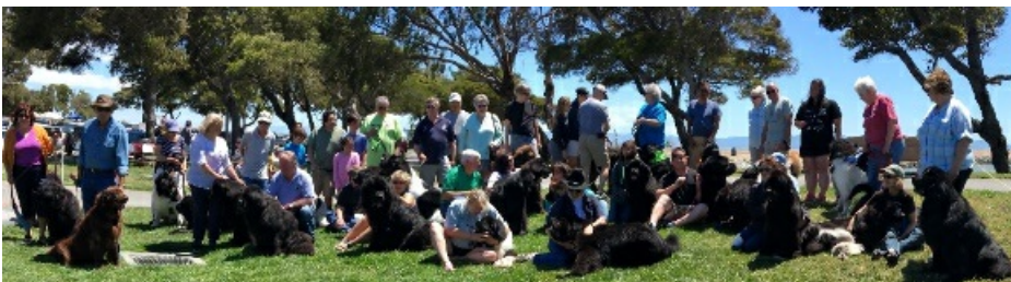
Everyone had a great time at the picnic!