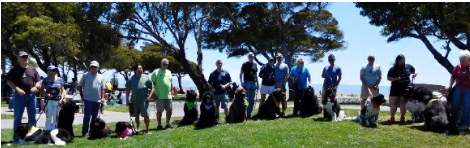
Rescued Newfoundlands enjoying the 2016 NCNC annual picnic