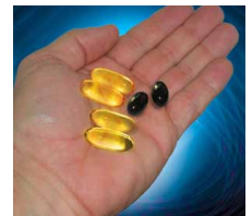
The Full Daily Dose: 2766 mgs of EPA/DHA per Day!

It's simple. One capsule from each type of Omega-3 twice a day, preferably the first dose early in the morning and the second dose just before bed. So the dose is three capsules in the morning and 3 capsules in the evening. Take the protocol before food in the morning and just before bed in the evening.