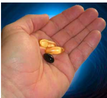
Morning / Evening Dose

It's simple. One capsule from each type of Omega-3 twice a day, preferably the first dose early in the morning and the second dose just before bed. So the dose is three capsules in the morning and 3 capsules in the evening. Take the protocol before food in the morning and just before bed in the evening.