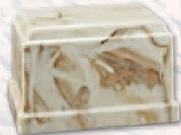
Basic Marble $175