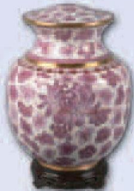
Palace Pink $335