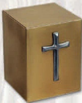
Silver Cross $145