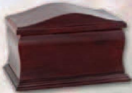
Classic Wood $195