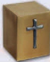
Silver Cross $145