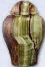
Onyx Vase $195