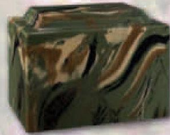
Green Camoflauge $175