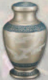
Going Home $205