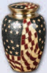
Old Glory $175