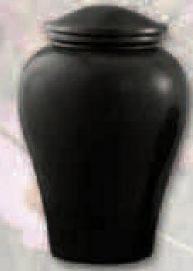
Black Marble $195