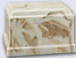
Basic Marble $175