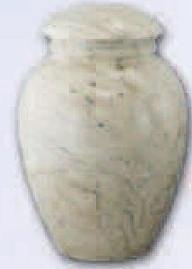
Grecian Travertine $195