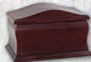
Classic Wood $195