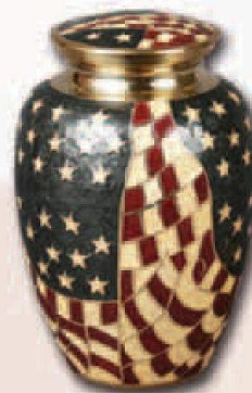
Old Glory $175