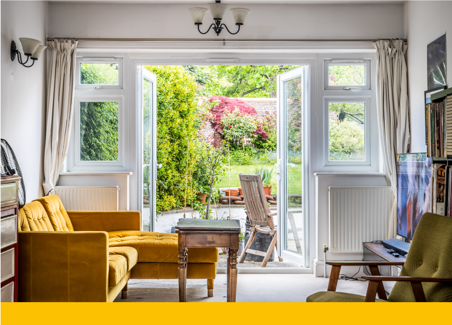
Detached 5 bedroom house, just under 2.000sqft with huge scope to extend and develop (subject to planning permission) overlooking the picturesque Richmond Park.