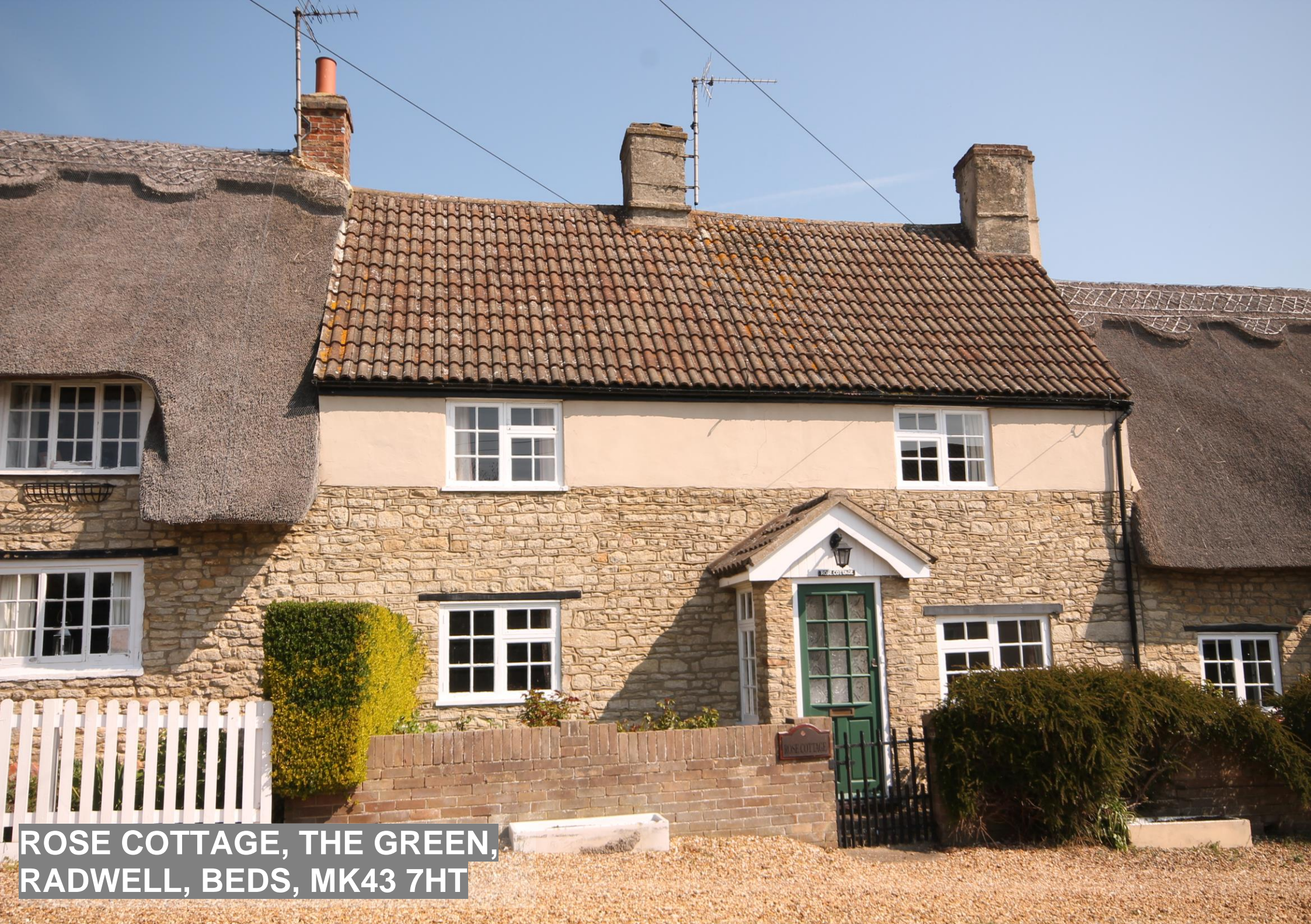
ROSE COTTAGE, THE GREEN, RADWELL, BEDS, MK43 7HT