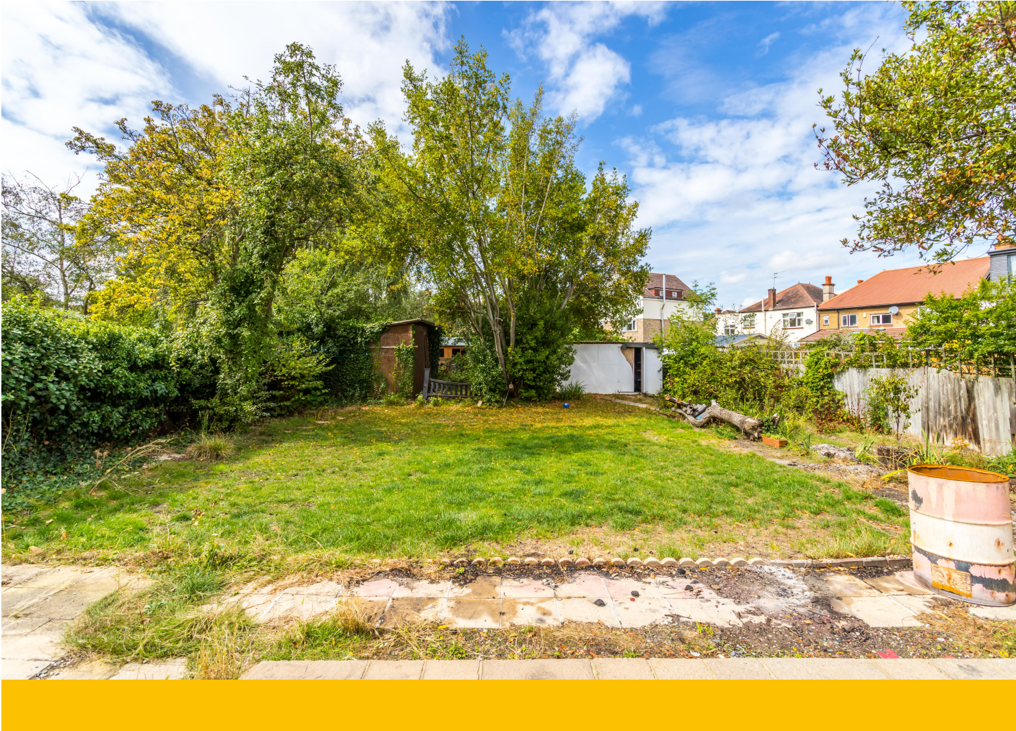
A large detached house with an abundance of space throughout, plenty of off-street parking and a large garden. Available now.