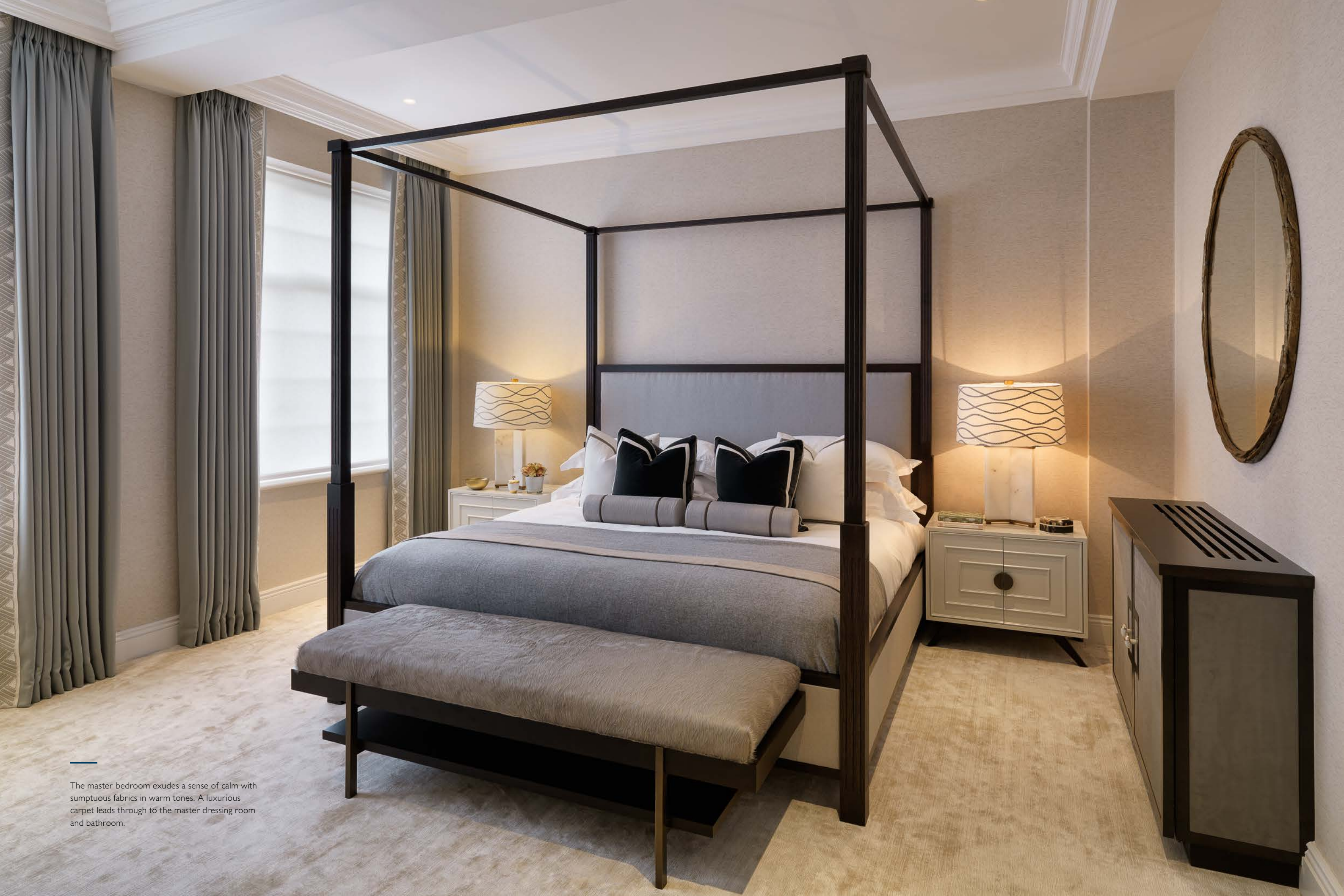
The master bedroom exudes a sense of calm with sumptuous fabrics in warm tones. A luxurious carpet leads through to the master dressing room and bathroom.