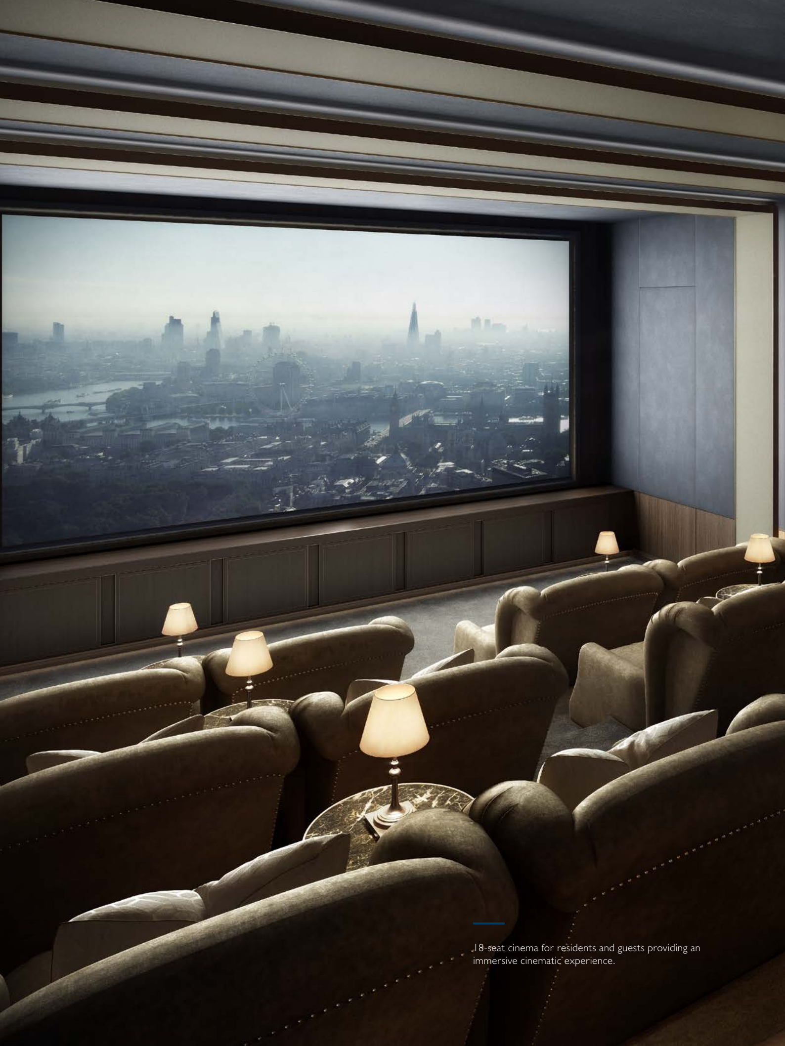
18-seat cinema for residents and guests providing an immersive cinematic experience.