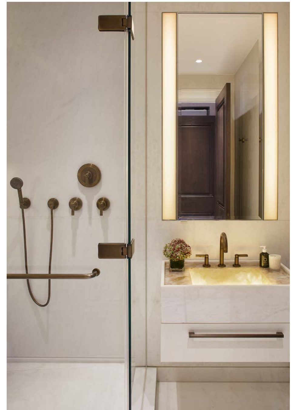
The third bedroom ensuite features a bespoke translucent Golden Ice Stone vanity, bronze tapware with statuary marble flooring.