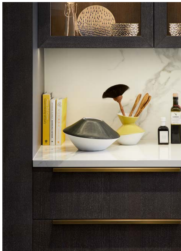
The handcrafted kitchen features bespoke cabinetry and integrated Sub-Zero Wolf and Miele appliances.