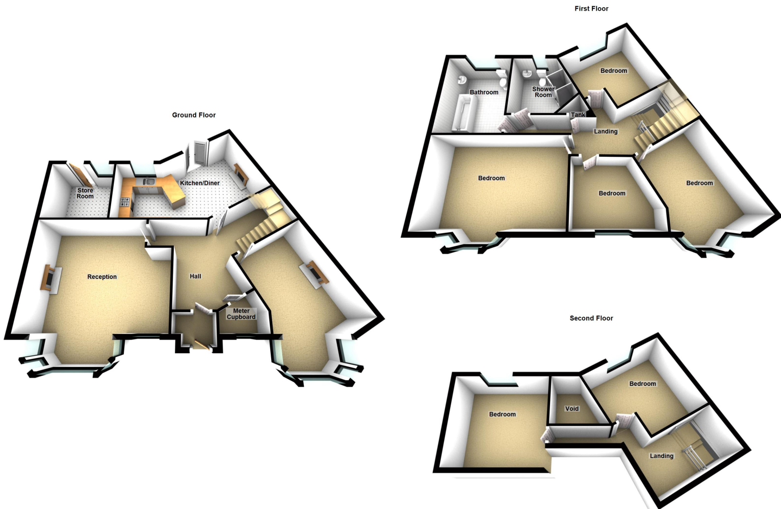
The Close, Liverpool

These particulars do not form part of any offer or contract and must not be relied upon as statements or representations of fact. Any areas, measurements or distances are approximate. The text, photographs and plans are for guidance only and are not necessarily comprehensive. It should not be assumed that the property has all the necessary planning, building regulation or other consents and we have not tested services, equipment or facilities. Purchasers must satisfy themselves by inspection or otherwise.